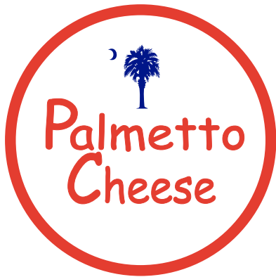
Stacked Logo with border & Palmetto Tree

When design circumstances exist and a logo with a compact footprint is more suitable, please use the stacked logo. The stacked logo is the only version that combines the Palmetto tree and moon symbol from the Pawleys Island Specialty Foods logo. Only provided files should be used for this logo and it should not be recreated with text.