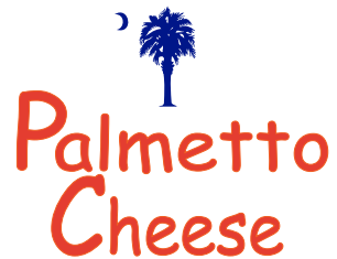
Stacked Logo, no slogan with white background & Palmetto Tree

Multiple versions of files for the logo and all variation files can be found on www.pimentocheese.com/branding . If you have a question on which logo should be used in a particular design, please email nathan@pimentocheese.com .