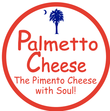
Stacked Logo with border & Palmetto Tree

When design circumstances exist and a logo with a compact footprint is more suitable, please use the stacked logo. The stacked logo is the only version that combines the Palmetto tree and moon symbol from the Pawleys Island Specialty Foods logo. Only provided files should be used for this logo and it should not be recreated with text.