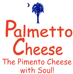
Stacked Logo with white background & Palmetto Tree