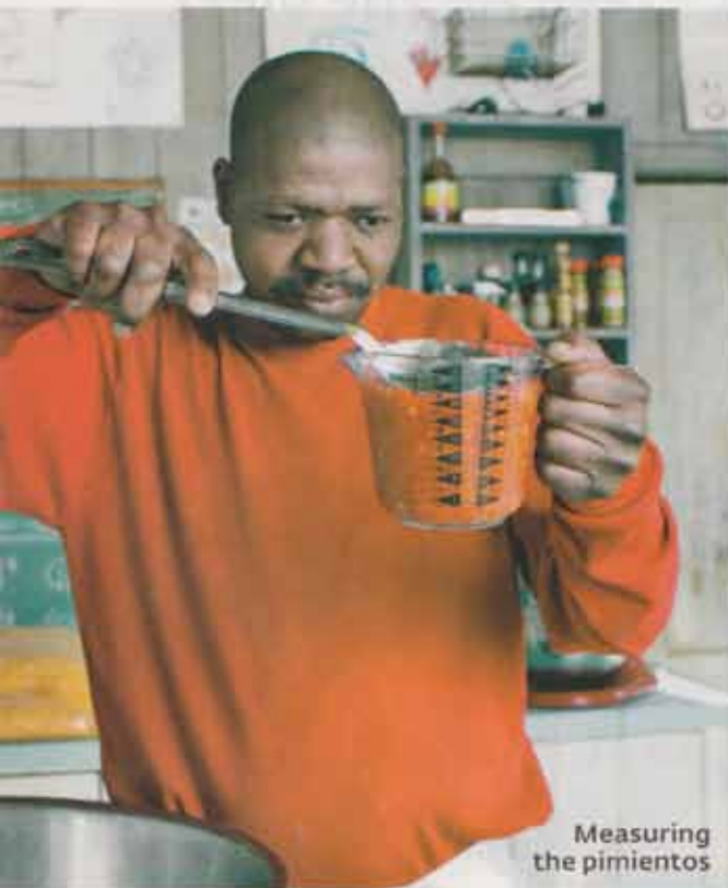
Measuring the pimientos