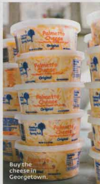
Buy the cheese in Georgetown.