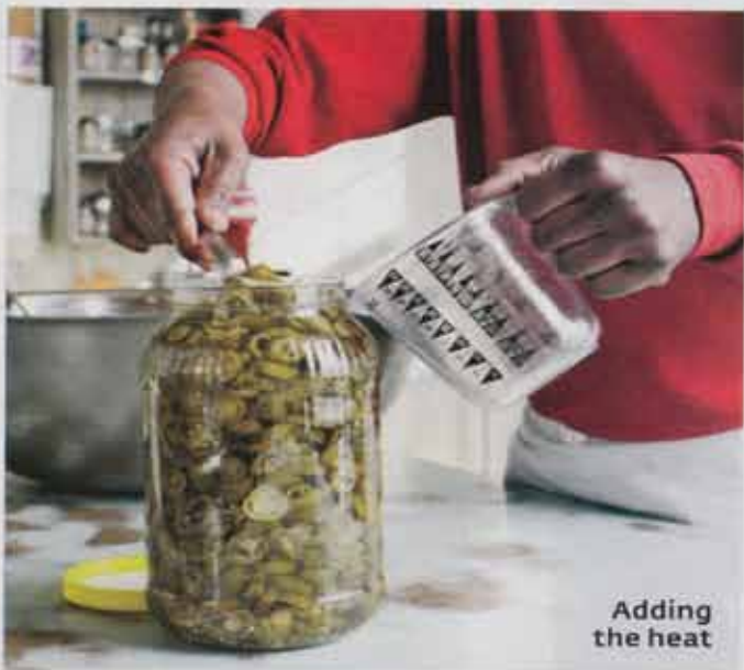
Adding the heat

"It comes in 5-pound bags, and I go through about 12 bags a week. So I use about 60 pounds of sharp Cheddar cheese a week." (TURN THE PAGE)